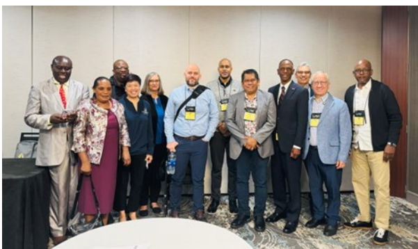
APC Conference Breakfast in Minneapolis, June 2025